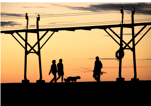
Pictured above is Grand Haven's widely recognized South Pier and "Cat-Walk" A popular destination for visitors to the Tri-Cities

Crockery Township is pleased to present this year's Drinking Water Quality Report. This report is designed to inform you about the quality of the water we deliver to you everyday. Our constant goal is to provide you with a safe and dependable supply of drinking water. We are committed to ensuring the quality of your drinking water.